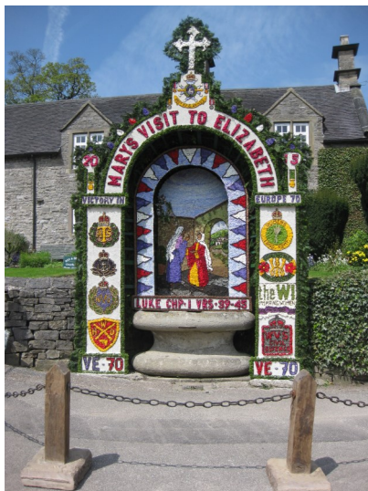
A dressed well

The walk starts from Tissington Station Car Park. Tissington is famous for its 'Well Dressing' which is held on Ascension Day (May 26th in 2022).