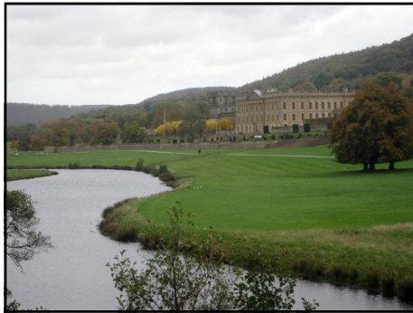
Chatsworth House and Park

The walk continues along the River Derwent to Carlton Lees where we will enter Chatsworth Park . After a short lunch stop we will walk on to Chatsworth House.